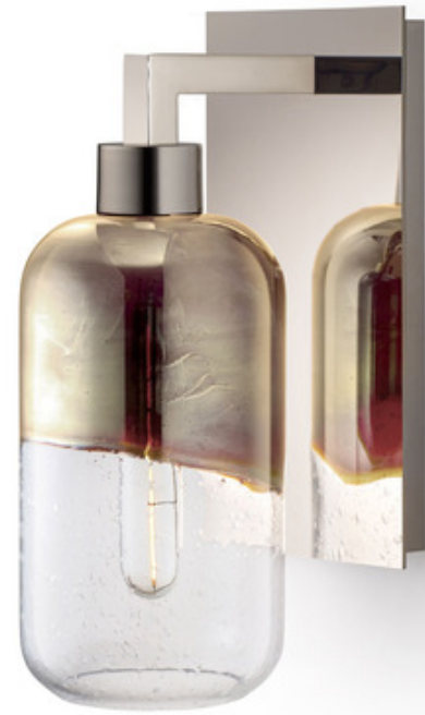
Shown in: Polished Nickel / Mercury / Effervescent

The Mercurio Wall Sconce combines a metallic, Mercury-colored coating with clear seeded glass for a rich pairing of textures that will enhance any interior. The mercury glass finish produces a reflective sheen that mirrors the sconce's surroundings, while the bubbles in the seeded glass create intriguing refractions of light from the included LED bulb.