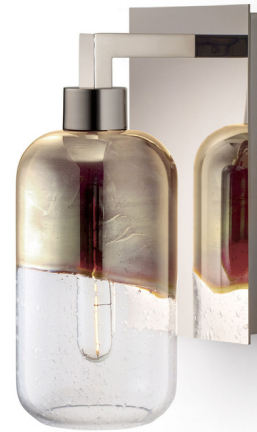
Shown in polished nickel / mercury / effervescent