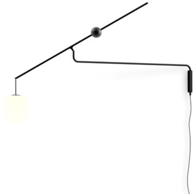
Shown in: Matte Black / Opal

The Malamata Wall Light takes its name from the Hebrew words for up and down in reference to its adjustable diffuser. Features two articulated arms with a spherical counterweight on the lamps's crossbar that can be moved from side to side, causing the opal glass globe diffuser to raise and lower as the bar tilts. Malamata's silhouette is comprised of simple geometric forms for a contemporary look that will also complement more traditional decor styles. Dimmer switch located on cord.