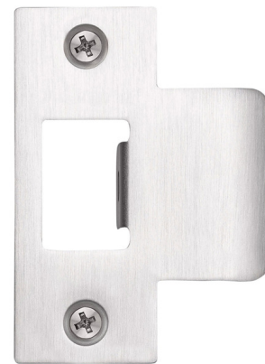
Shown in steel

The T-Shape Strike Plate Kit is made of solid Metal and designed to be paired with Buster + Punch door hardware and latch accessories. Suitable for internal doors. Black: Made from Aluminum and then anodized to give a deep Black finish. Brass: Made from precision-machined solid brass and finished with two layers of durable satin lacquer. This finish will age slowly, moving from radiant brass to deeper and golden within a few years. Steel: Made from solid stainless steel and refined by hand. Steel is Buster + Punch's most durable finish and will remain the same for years to come.