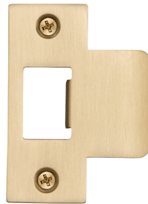
Shown in brass

The T-Shape Strike Plate Kit is made of solid Metal and designed to be paired with Buster + Punch door hardware and latch accessories. Suitable for internal doors. Black: Made from Aluminum and then anodized to give a deep Black finish. Brass: Made from precision-machined solid brass and finished with two layers of durable satin lacquer. This finish will age slowly, moving from radiant brass to deeper and golden within a few years. Steel: Made from solid stainless steel and refined by hand. Steel is Buster + Punch's most durable finish and will remain the same for years to come.