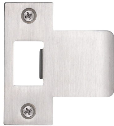
Shown in steel

The T-Shape Strike Plate Kit is made of solid Metal and designed to be paired with Buster + Punch door hardware and latch accessories. Suitable for internal doors. Black: Made from Aluminum and then anodized to give a deep Black finish. Brass: Made from precision-machined solid brass and finished with two layers of durable satin lacquer. This finish will age slowly, moving from radiant brass to deeper and golden within a few years. Steel: Made from solid stainless steel and refined by hand. Steel is Buster + Punch's most durable finish and will remain the same for years to come.