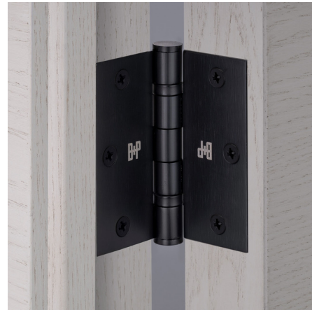
Shown in welders black

The Door Hinge from Buster + Punch is made from solid Metal and features countersunk screw holes. Sold as a set of 2. Welders Black: Made from Stainless Steel with a durable Black PVD coating. This is a deep off-black finish. Brass: Made from precision-machined solid brass and finished with two layers of durable satin lacquer. This finish will age slowly, moving from radiant brass to deeper and golden within a few years. Steel: Made from solid stainless steel and refined by hand. Steel is Buster + Punch's most durable finish and will remain the same for years to come.