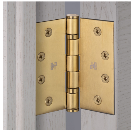
Shown in brass

The Door Hinge from Buster + Punch is made from solid Metal and features countersunk screw holes. Sold as a set of 2. Welders Black: Made from Stainless Steel with a durable Black PVD coating. This is a deep off-black finish. Brass: Made from precision-machined solid brass and finished with two layers of durable satin lacquer. This finish will age slowly, moving from radiant brass to deeper and golden within a few years. Steel: Made from solid stainless steel and refined by hand. Steel is Buster + Punch's most durable finish and will remain the same for years to come.