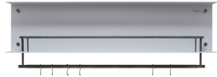
Shown in gun metal / stone

The Hanger Shelf is a contemporary storage solution that will bring an industrial aesthetic to your space. It features a laser cut sheet Aluminum, press bent and powder coated and complemented by a hand polished Metal guard rail and pan rail. Fixing screws are not supplied. Brass: Made from precision-machined solid brass and finished with two layers of durable satin lacquer. This finish will age slowly, moving from radiant brass to deeper and golden within a few years. Gun Metal: Made from Stainless Steel and then finished with Gun Metal PVD. Will stay the same for years to come. Easy to clean. Steel: Made from solid stainless steel and refined by hand. Steel is Buster + Punch's most durable finish and will remain the same for years to come.