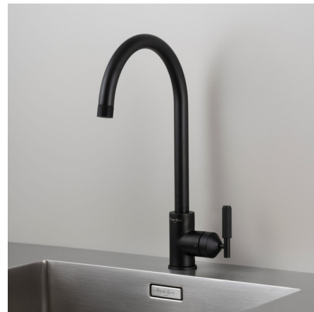
Shown in welders black

COLOR N/A BODY FINISH Welders Black WATTAGE N/A DIMMER N/A DIMENSIONS 1.88"W x 14.6"H x 9.9"D BULB N/A