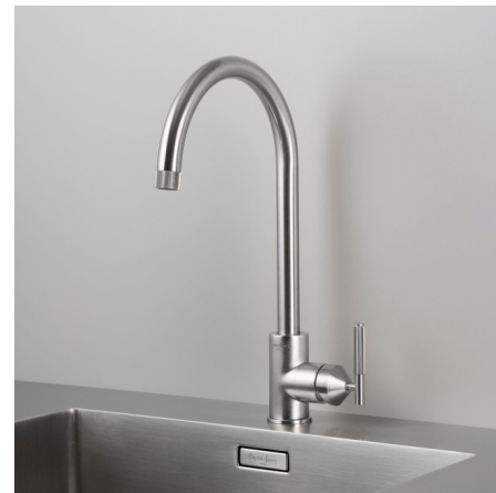
Shown in steel

The Buster + Punch Linear Kitchen Faucet offers a seamless and sophisticated look for any kitchen. This single-lever faucet mixes hot and cold, aerated water. It features a rough-cast and precision-machined Solid Metal with their signature linear-knurl lever and linear-knurl aerator cap. Available with or without a pull-out sprayer. Note: Not all options are available. Maximum thickness of mounting surface: 40mm, with supplied fixings Recommended water pressure: 7.25 PSI (0.5 BAR) - 72 PSI (5 BAR) Recommended maximum hot water temperature: 70C (158F) Welders Black: Made from Stainless Steel with a durable Black PVD coating. This is a deep off-black finish. Gun Metal: Made from Stainless Steel and then finished with Gun Metal PVD. Will stay the same for years to come. Easy to clean. Steel: Made from solid stainless steel and refined by hand. Steel is Buster + Punch's most durable finish and will remain the same for years to come.