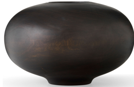
Shown in brown

The Surround Vase is crafted from a single piece of solid mango wood. The wood's unique grain is highlighted by the vase's symmetrical, curving form. Note: When displaying flowers in the Surround Vase, it is recommended to put a smaller glass vase with water inside the Surround Vase to prevent damage to the wood.