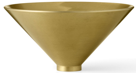
Shown in brass

The Taper Bowl is a versatile piece that will complement any interior with its understated design. The simple conical silhouette is crafted from aluminum with a brass finish. Place the Taper Bowl on an entryway table to serve as a catch-all, or leave it unfilled as a decorative object.