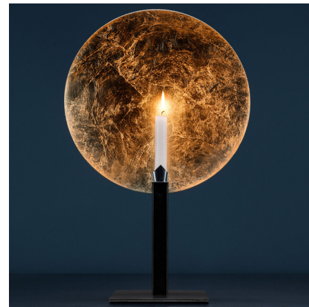
Shown in iron / gold leaf

The Gemma Candle Holder features a rough iron base topped by a disc finished in a metallic leaf material. The disc reflects light from the candle to amplify its warm glow. The metallic leaf adds an interesting visual texture to Gemma's simple, geometric design.