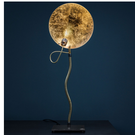
Shown in iron / gold leaf

When designing the Luce d'Oro Table Lamp, Enzo Catellani was inspired by both the shape and warm glow of the sun, as seen in the lamp's reflective disc in metallic Gold, Silver, or Copper leaf finish. The disc and light socket are each attached to a flexible arm, allowing light to be aimed directly or reflected off of the disc for an indirect lighting effect. The square iron base provides a touch of industrial aesthetics. On/off switch located on socket.