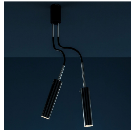
Shown in black / black

When designing the Lucenera series, Enzo Catellani aimed to move the emphasis off of the fixture and onto the light it produced. To accomplish this goal, Catellani used the simple shape of cylinders mounted onto flexible arms, allowing the light to be aimed precisely where it is needed most. Available in Black or White with nickel details. Includes matching black or white mounting plate to cover standard US junction box.