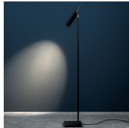
Shown in black

When designing the Lucenera series, Enzo Catellani aimed to move the emphasis off of the fixture and onto the light it produced. To accomplish this goal, Catellani used the simple shape of a cylinder mounted onto a simple post and square base. The articulated head allows the light to be aimed precisely where it is needed most. Available in Black or White with nickel details. On/off switch located on lamp head.