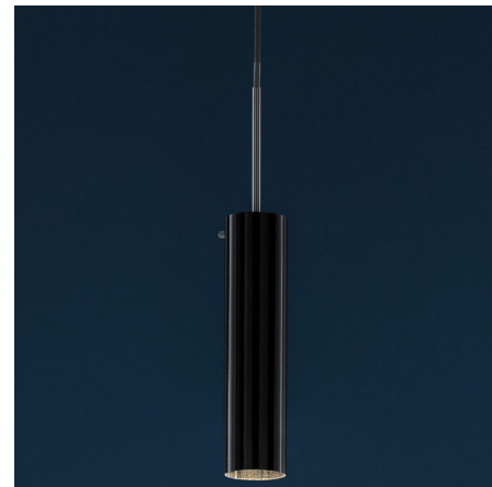
Shown in black

When designing the Lucenera series, Enzo Catellani aimed to move the emphasis off of the fixture and onto the light it produced. To accomplish this goal, Catellani used the simple shape of a single cylinder suspended from a round canopy. The angle and intensity of the light beam can be adjusted by sliding the nickel rod along the pendant's cable. Includes matching black or white mounting plate to cover standard US junction box.