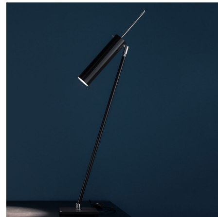
Shown in black

When designing the Lucenera series, Enzo Catellani aimed to move the emphasis off of the fixture and onto the light it produced. To accomplish this goal, Catellani used the simple shape of a single cylinder mounted onto a simple post and square base. The angle and intensity of the light beam can be adjusted by sliding the nickel rod protruding from the lamp's head. On/off switch located on lamp's head.