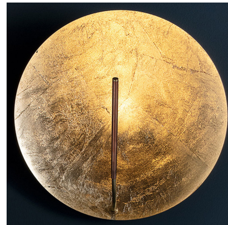
Shown in gold leaf / copper

The Luna Wall Sconce will make a bold statement in any space with its rich texture. The aluminum disc has been treated with a metallic leaf finish that reflects light outwards to produce a warm glow. The LED light source is housed at the end of a flexible arm, which can be adjusted to change the angle of the reflected light.