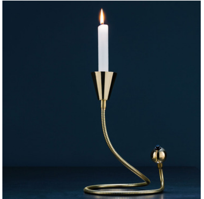
Shown in: Brass

The Miracolo Candler Holder features a flexible brass arm that allows for a variety of configurations. The flexible portion is capped by a brass orb on one end and a tapered candle holder on the other for a modern, slightly industrial, aesthetic.