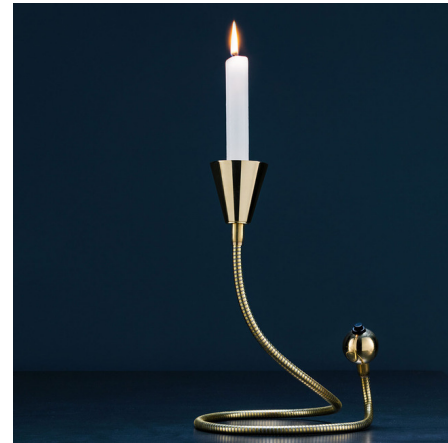
Shown in brass

The Miracolo Candler Holder features a flexible brass arm that allows for a variety of configurations. The flexible portion is capped by a brass orb on one end and a tapered candle holder on the other for a modern, slightly industrial, aesthetic.