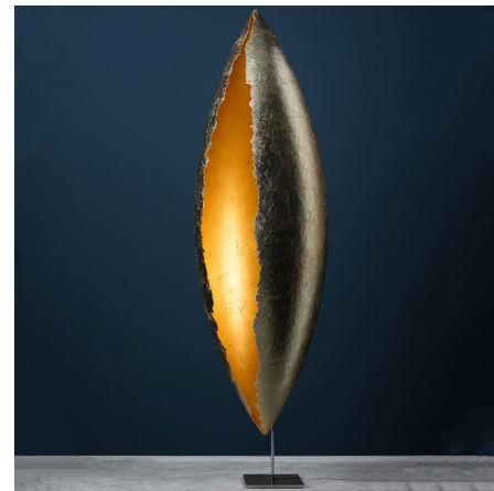
Shown in nickel / silver leaf

The PostKrisi collection was Enzo Catellani's first foray into working with fiberglass. While he was initially intrigued by the material's light weight and strength, he was captivated by the shadows cast as it interacts with light. The PostKrisi F100 Floor Lamp features an oblong shape with pointed tips atop a square nickel base. Integrated LEDs housed within the lampshade cast a warm glow that emanates from inside. Available in White Painted Fiberglass, Gold Leaf, or Silver Leaf. Dimmer switch located on cord.