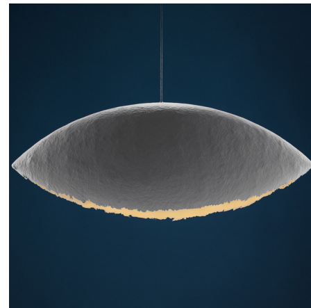
Shown in nickel / white painted fiberglass

COLOR RENDERING . . . . . 80 CRI LAMP COLOR . . . . . 2700K LUMENS/WATT . . . . . 112.50 LUMINOUS FLUX . . . . . 900 lumens