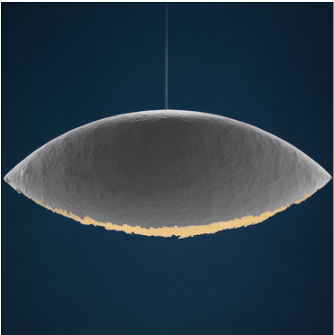
Shown in: Nickel / White Painted Fiberglass

The PostKrisi collection was Enzo Catellani's first foray into working with fiberglass. While he was initially intrigued by the material's light weight and strength, he was captivated by the shadows cast as it interacts with light. The PostKrisi Pendant features an oblong shape with pointed tips. As light passes by the rough edges of the fiberglass, an irregularly shaped pool of light is cast upon the room. Includes round Nickel mounting plate to cover standard US junction box, round Nickel canopy, and Grey braided fabric cord.