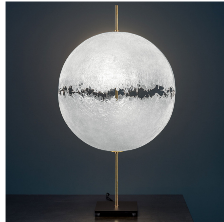
Shown in black / brass / natural fiberglass

The PostKrisi collection was Enzo Catellani's first foray into working with fiberglass. While he was initially intrigued by the material's light weight and strength, he was captivated by the shadows cast as it interacts with light. The PostKrisi Globe Table Lamp features a pair of fiberglass hemispheres mounted on a central metal rod. As light passes by the rough edges of the fiberglass, an irregularly shaped band of light is cast upon the room. Available in translucent Natural Fiberglass or White Painted Fiberglass with Nickel rod and base or Brass rod and Black base. Dimmer switch located on cord.