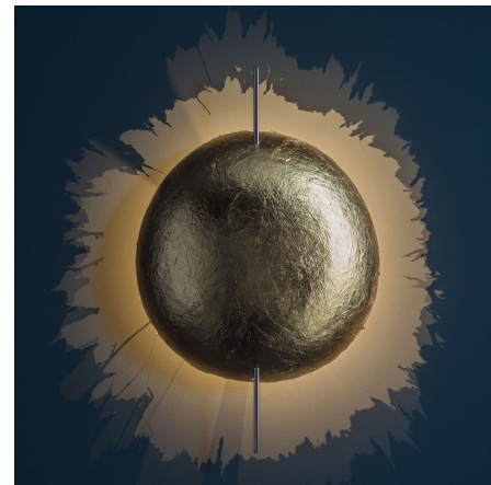
Shown in nickel / gold leaf

COLOR RENDERING . . . . . 85 CRI LAMP COLOR . . . . . 2700K LUMENS/WATT . . . . . 280.00 LUMINOUS FLUX . . . . . 280 lumens