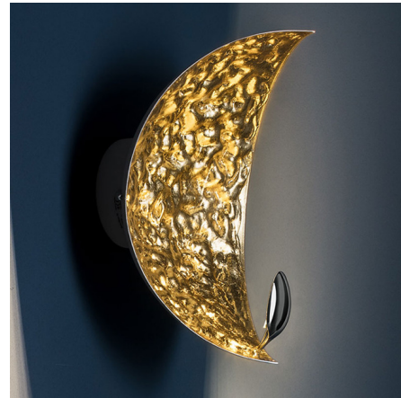
Shown in white / gold leaf

The Stchu-Moon Dome Floor Lamp features a quarter-sphere shape lined with a roughly textured, metallic leaf material. When illuminated by the integrated LED light source, the metallic leaf amplifies the light and appears to take on a glow of its own. Includes white metal mounting plate to cover standard US junction box.