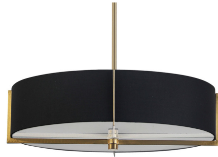
Shown in aged brass / black

PRODUCT DIMENSIONS . . . . Downrods Included: 1-4", 1-8", 1-11" and 1-20" Stems