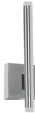
Shown in polished chrome / frosted