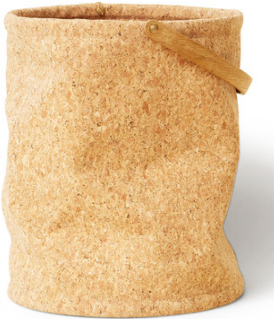
Shown in: Brass / Cork

The Nest Cork Paper Bin is a take on the classic paper bin but was also intended to be in general use in the home as a magazine holder or for different kinds of everyday objects. The crumpled look is a result from the designer wanting the product to be flat-packed during shipping, and this practical design choice has resulted in one of the item's most characteristic features. Its double layer of ultra-fine cork fabric hand sewn together as well as steam bent wood handle define the object's overall quality and rich detailing.