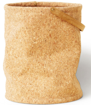
Shown in brass / cork

The Nest Cork Paper Bin is a take on the classic paper bin but was also intended to be in general use in the home as a magazine holder or for different kinds of everyday objects. The crumpled look is a result from the designer wanting the product to be flat-packed during shipping, and this practical design choice has resulted in one of the item's most characteristic features. Its double layer of ultra-fine cork fabric hand sewn together as well as steam bent wood handle define the object's overall quality and rich detailing.