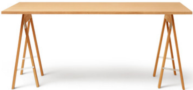
Shown in: Natural Oak

The Linear Tabletop Table is heavy and sturdy. It is constructed using a core board of solid Danish pine covered with oak veneer. The solid wood inside allows for a very slim tabletop which is reversible, resulting in the added utility of providing two surfaces in one tabletop. Note: 80.7 inch option only available in Natural Oak. Note: Tabletop only. Trestle sold separately.