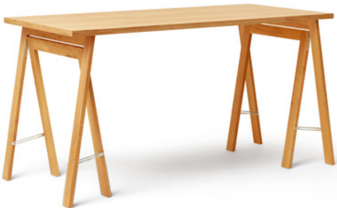
Shown in: Natural Oak

The Linear Tabletop Table is heavy and sturdy. It is constructed using a core board of solid Danish pine covered with oak veneer. The solid wood inside allows for a very slim tabletop which is reversible, resulting in the added utility of providing two surfaces in one tabletop. Note: 80.7 inch option only available in Natural Oak. Note: Tabletop only. Trestle sold separately.