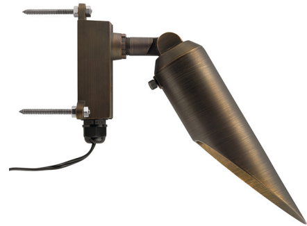
Shown in centennial brass

The Long Cowl Mini Downlight with an extra-long cowl is ideal for illuminating walkways or entertainment spaces, or for creating moon lighting by placing it in a tree to accentuate branch and leaf details. The cowl can be rotated to minimize glare. With durable metal construction, this fixture is designed to withstand harsh outdoor environments. The Centennial Brass finish will patina over time. Includes a surface mounting bracket (model 15607), locknut, 35 inches of usable #18-2, SPT-1W leads and cable connectors. Notes: A transformer is required, sold separately. This fixture is to be used only with a transformer rated a maximum of 300W (25 amps) 15V. The optional junction box mounting bracket pictured for tree mounting is not included and is sold separately.