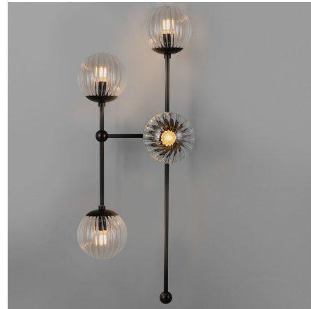
Shown in black gunmetal / dries ribbon

The Armstrong Tall Wall Sconce features glass globe shades connected by an intersecting network of sleek metal stems. The contrast of the globes' curves and the frame's right angles creates a modern, geometric look with a hint of playfulness. Available in Left or Right configurations.