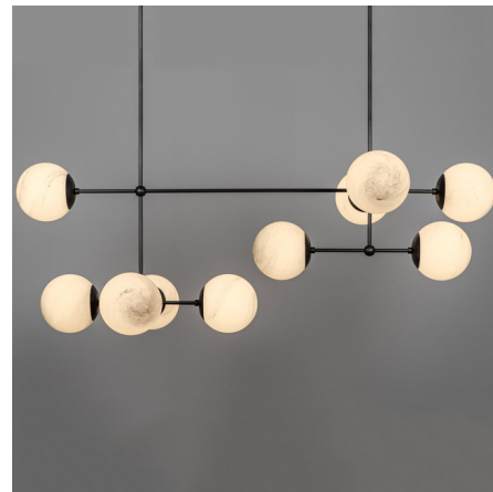
Shown in black gunmetal / marble matte

The Armstrong Linear Chandelier features glass globe shades connected by an intersecting network of sleek metal stems. The contrast of the hand blown glass globes curves and the frame's right angles creates a modern, geometric look with a hint of playfulness. Note: Each piece of glass is unique with natural patterns which is part of the appeal of this fixture. As a result, the manufacturer cannot guarantee each fixture will match.