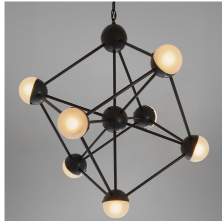
Shown in black gunmetal / sand blasted

The Molecule Chandelier features an assortment of hemispherical glass shades radiating from a central nucleus. Metal bars link the globes to form a cubic shape reminiscent of a molecular structure. While Molecule draws upon mid-century design for inspiration, it is composed of simple geometric forms that will complement any interior style.