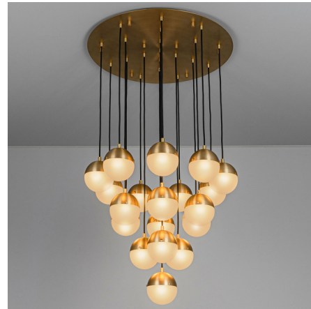
Shown in lacquered burnished brass / sand blasted

The Molecule Cluster Multi Light Pendant features a cascade of hemispherical glass shades capped with a metal domes. Molecule's simple, straightforward shades make it a versatile fixture that will complement a variety of decor styles.