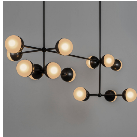
Shown in black gunmetal / sand blasted

The Molecule Linear Chandelier features an arrangement of simple geometric forms with a playful expression. Intersecting metal bars are tipped with half-glass/half-metal orbs to house the light bulbs and direct light in all directions.