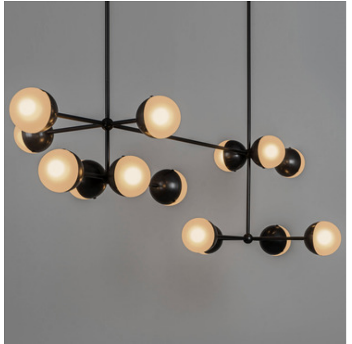
Shown in: Black Gunmetal / Sand Blasted

The Molecule Linear Chandelier features an arrangement of simple geometric forms with a playful expression. Intersecting metal bars are tipped with half-glass/half-metal orbs to house the light bulbs and direct light in all directions.