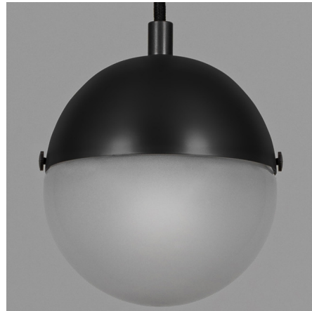
Shown in black gunmetal / sand blasted

LAMP COLOR . . . . . 2700K LUMENS/WATT . . . . . 100.00 LUMINOUS FLUX . . . . . 500 lumens