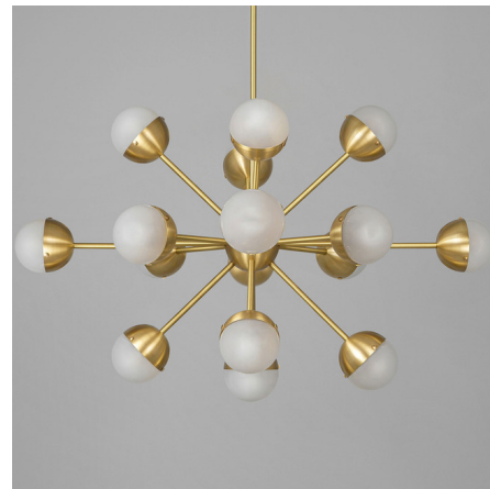
Shown in lacquered burnished brass / sand blasted

The Molecule Spark Oval Chandelier features an assortment of hemispherical glass shades radiating from a central nucleus. While Molecule draws upon mid-century design for inspiration, it is composed of simple geometric forms that will complement any interior style.