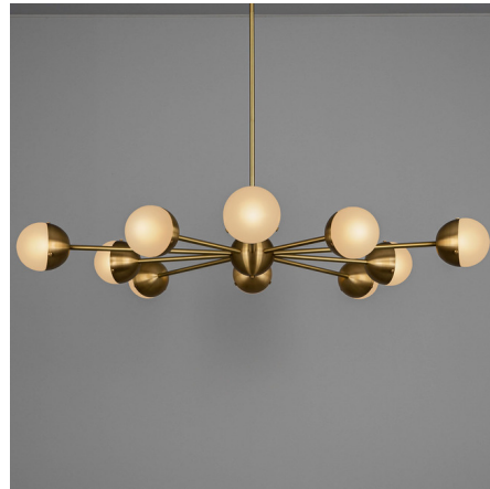
Shown in lacquered burnished brass / sand blasted

LAMP COLOR . . . . . 2700K LUMENS/WATT . . . . . 1,000.00 LUMINOUS FLUX . . . . . 5000 lumens