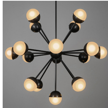
Shown in black gunmetal / sand blasted

The Molecule Spark Sputnik Chandelier features an assortment of hemispherical glass shades radiating from a central nucleus. While Molecule draws upon mid-century design for inspiration, it is composed of simple geometric forms that will complement any interior style.