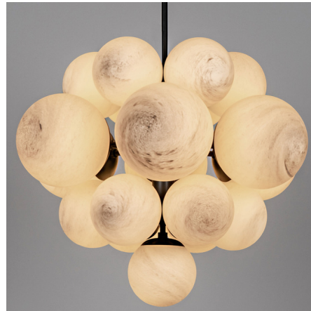
Shown in black gunmetal / marble matte

The Nova Chandelier features a cluster of globe shaped shades grouped around a slim pendant stem. As the fixture is viewed from different angles, its shape appears to change, creating visual interest.