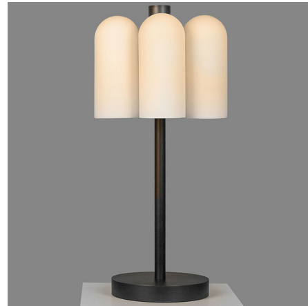
Shown in black gunmetal / opal matte

The Odyssey Cluster Table Lamp's grouping of opal glass shades will produce a warm, diffused glow in any space. The diffusers feature a cylindrical shape rising to a domed top, symmetrically arranged around a slim base for a serene, balanced expression. On/off switch located on cord.