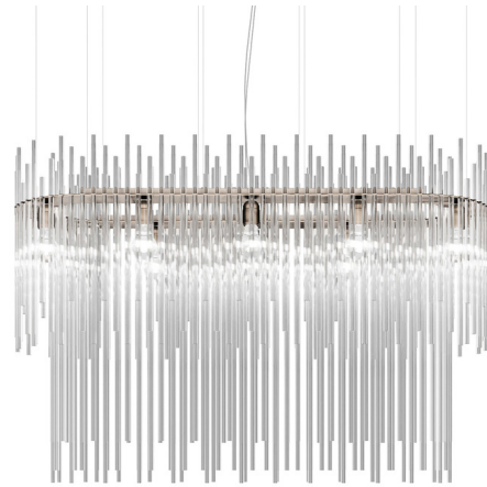
Shown in matte bronze / crystal

The Diadema Two-Tier Linear Pendant is a dramatic double-layer arrangement of crystal rods on an oval metal frame, offering a gleaming, dynamic display of light for entryways, dining areas and living rooms. Note: Requires a junction box rated for fixtures weighing over 50 pounds.