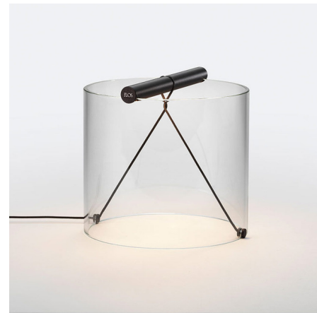
Shown in anodized black / clear

COLOR RENDERING . . . . . 90 CRI LAMP COLOR . . . . . 2700K LUMENS/WATT . . . . . 50.00 LUMINOUS FLUX . . . . . 350 lumens