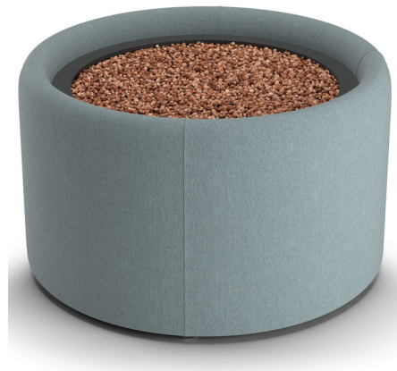
Shown in electric

The BuzziPlanter Small Planter is crafted with a unique design vision that complements modern decor while delivering acoustic-dampening functionality. This planter is wrapped in recycled felt that absorbs sound and helps limit the ambient noise in open spaces. It's ideal for open floor plan offices, home studios and office spaces, nurseries, and more.