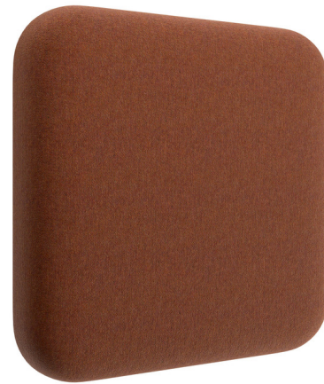
Shown in autumn

Cut down on ambient audio noise in open floor plan spaces with the BuzziTab Acoustic Wall Panel. Each is crafted from wood with recycled fabric and round edges designed to absorb reflected sound to cut down on echoes and ambient noise. It's a colorful and unique solution for a common issue in workplaces, home offices and more.