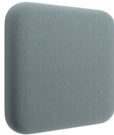
Shown in electric

Cut down on ambient audio noise in open floor plan spaces with the BuzziTab Acoustic Wall Panel. Each is crafted from wood with recycled fabric and round edges designed to absorb reflected sound to cut down on echoes and ambient noise. It's a colorful and unique solution for a common issue in workplaces, home offices and more.