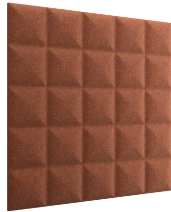
Shown in autumn

The power of color and advanced high-quality acoustic dampening combine to make the BuzziTile Acoustic Wall Panel a must have for open floor plan spaces. This no-stitch, felt-backed panel features a 3D pattern and recycled fabric exterior that is engineered to absorb and muffle mid- and high-tone ambient sound. It's a playful and visually engaging solution for a common problem in open floor plan spaces, including offices, home workspaces and more.