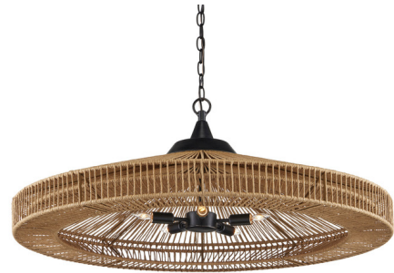
Shown in black / natural

PRODUCT DIMENSIONS . . . . . Adjustable Height: 19" to 87"